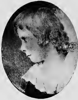
SIR WALTER SCOTT BART THE BATH MINIATURE